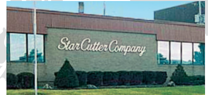
Star Cutter Co., Farmington Hills/Michigan