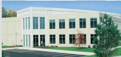
Star SU LLC, Hoffman Estates/Illinois

SU America Inc. 5200 Prairie Stone Parkway, Suite 100 Hoffman Estates, IL 60192 USA Tel.: 847 649 1450 Fax: 847 649 0112 sales@suamerica.com