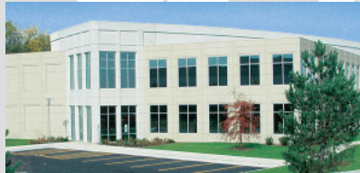
Star SU LLC, Hoffman Estates/Illinois

SU America Inc. 5200 Prairie Stone Parkway, Suite 100 Hoffman Estates, IL 60192 USA Tel.: 847 649 1450 Fax: 847 649 0112 sales@suamerica.com